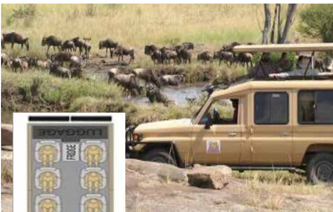
Vehicles on Safari

After breakfast, transfer to Nairobi for lunch before heading to Jomo Kenyatta Intl Airport.