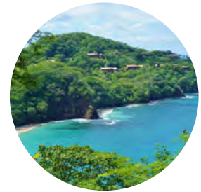
More time off-ship with 2-3 landings per day^