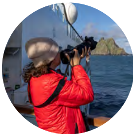
Professional photographer onboard