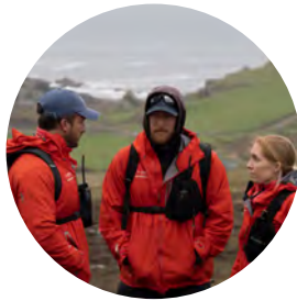
Unmatched knowledge of our Expedition Team