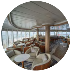
Relaxed & informal onboard experience