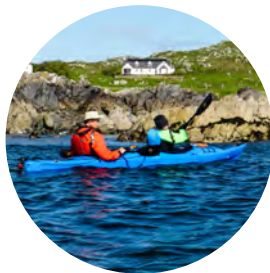
Extensive Activity Program