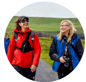
Leading Health & Safety Program